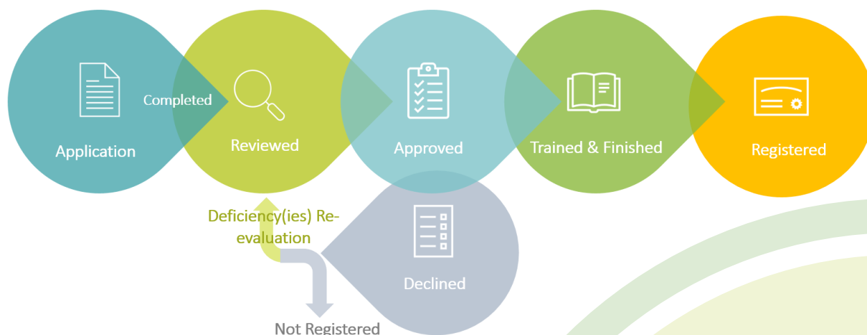
Figure 1.0 The College’s Application and Registration Process

The following outlines the College’s internal application and registration process (figure 1.0) step by step and the responsible parties including College staff and volunteer assessors and what that occur in each stage of the process. The entire application and registration process occurs online through the College’s portal (). The only step that does not occur in the portal is the signing of the registration certificates by the Registrar.