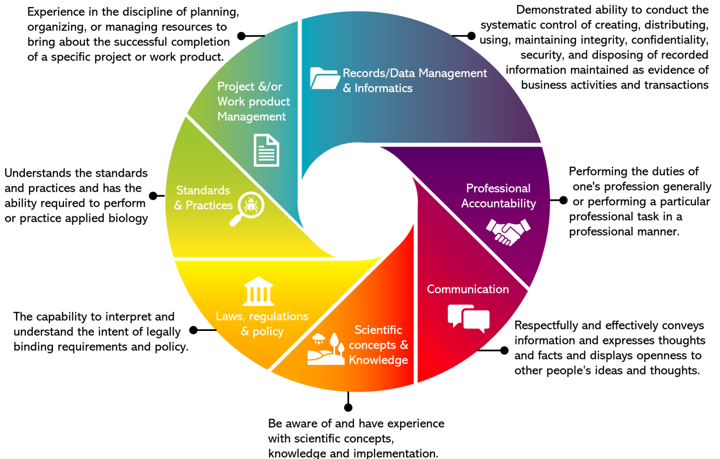
Figure 1.0 Professional Practice Competencies.